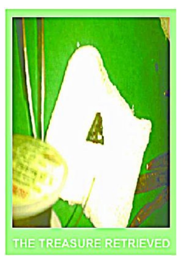
Figure. 6: The metallic clip which was retreived