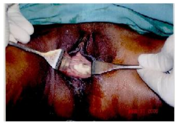
Figure. 1: Bladder stone protruding from the vagina