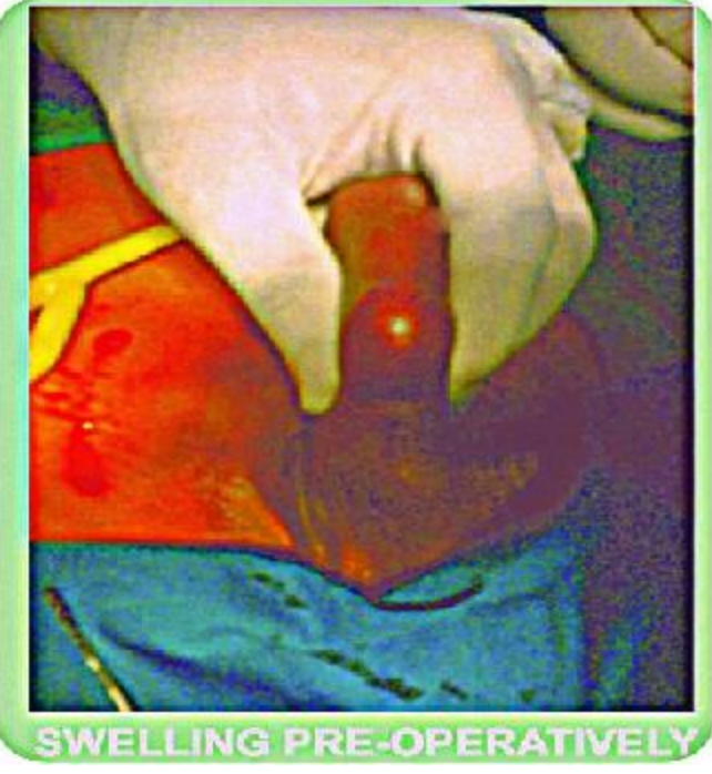
Figure. 4: Swelling seen on the ventral aspect of the penile shaft