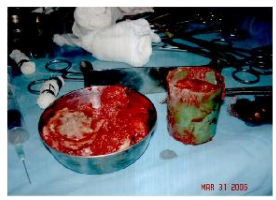
Figure.3: Foreign body (plastic container) and the broken pieces of calculi.